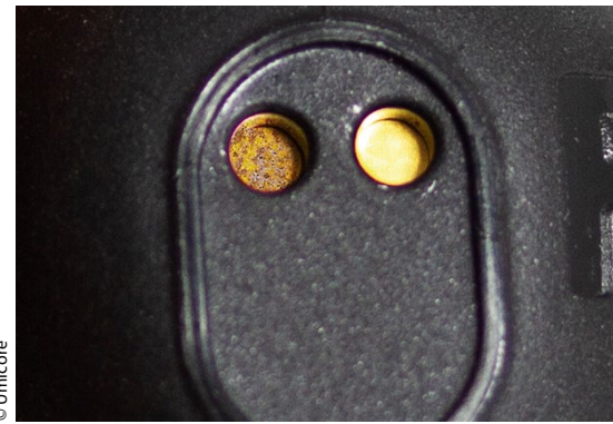
Contacts of a fitness bracelet after the charging process. The left contact, previously contaminated with sweat solution, shows a clear corrosion of the gold layer in comparison to the right contact, which was not contaminated.

in two ways: on the one hand, the product reliability gained is positive for the image of the manufacturer. On the other hand, the overall costing is significantly more economical – despite the investment for the alloy being four times higher than for the gold layer.